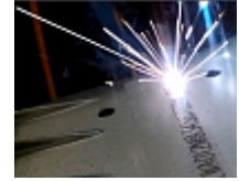
Vehicle Identification Number (VIN) Marking