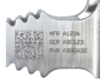
Aerospace Part Marking Standards