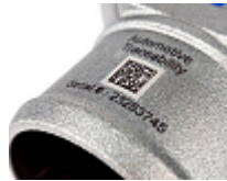
Serial Number Marking