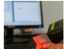
Production Data Monitoring