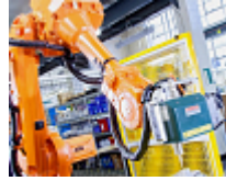
Automated Part Marking